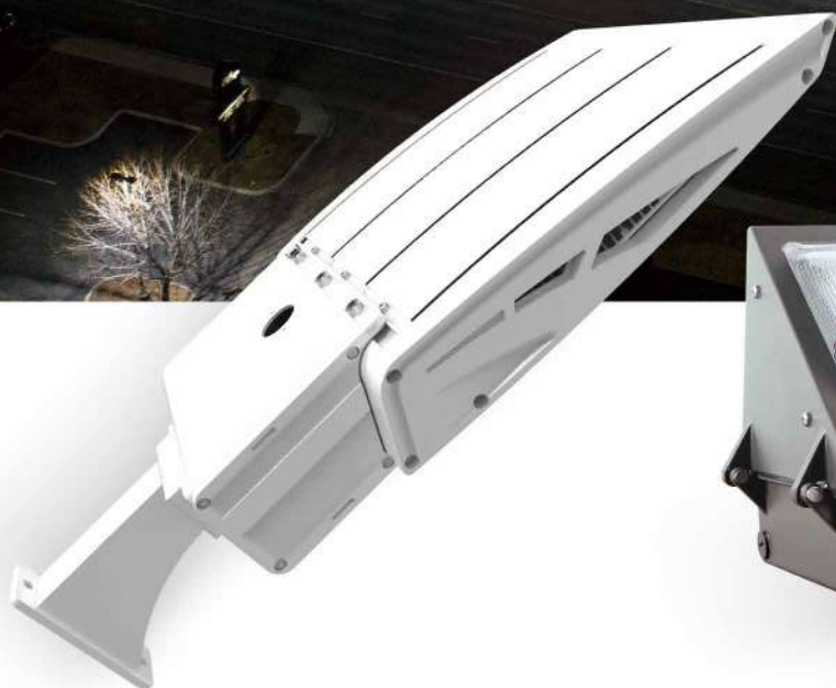
• LED Shoebox Light