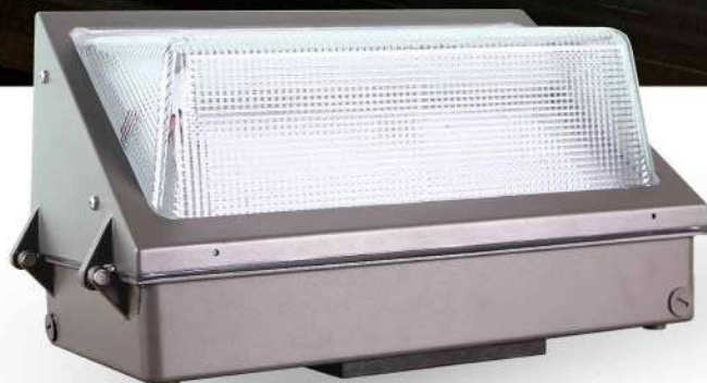
• LED Wall Pack